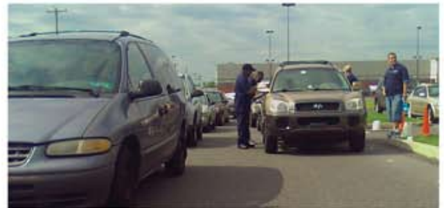
Volunteers etch VIN numbers on windows. The group etched nearly 300 vehicles.

Click to Order a Free Do-It-Yourself VINgraving Kit