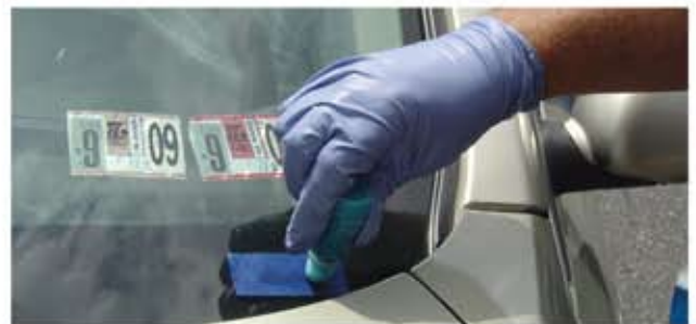
A volunteer applies the etching solution to the VIN stencil.