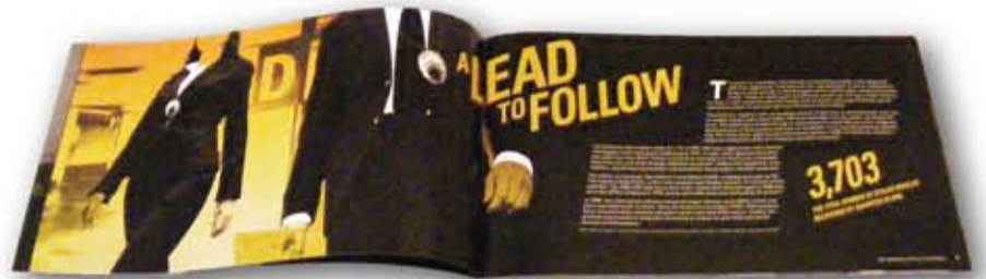
ATPA 2008 Annual Report, entitled "A True Crime Story" highlighted the players that make fighting auto theft in Pennsylvania an ensemble effort.

Thefts down 57% since the inception of the ATPA