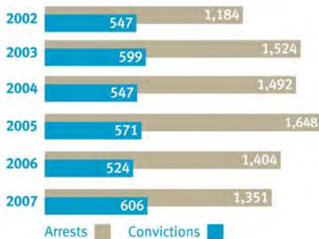
Impact of grantees' combined efforts.

Grants Awarded vs. Estimated Value of Recovered Vehicles, Parts and Restitution. Total grants from 2002-2007: $34M