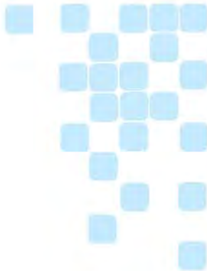
Individuals arrested and convicted.