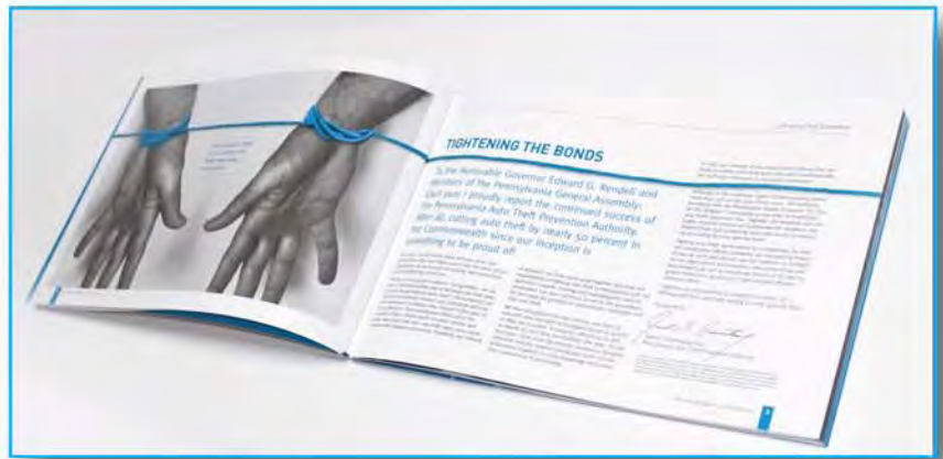
PA Auto Theft Prevention Authority's 2007 annual report, chairperson's letter to Governor Edward G. Rendell.

ATPA Celebrates Milestones: Thefts Down 10% in 2007, 50% Since Inception of Organization