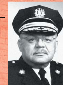
Charles H. Ramsey Commissioner, Philadelphia Police Department