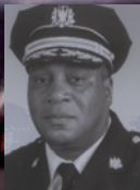
Sylvester Johnson Commissioner Philadelphia Police Department