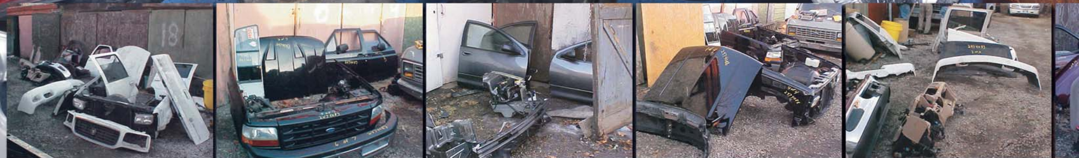
The Philadelphia Police busts active chop shops, fighting on the front line of Auto Theft Prevention.

Ten-Year Total $ 10,806,373 M $ 2,166,036 M